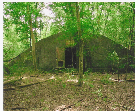
WWII Naval Ammunition Magazine Belle Chasse, Louisiana

associated with the Naval Ammunition Depot property.