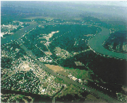
English Turn/Lower Coast/Belle Chasse Peninsula

needed who are willing to be trained to collect the oral histories. The Library of Congress is funding LSU to train our volunteers. Woodlands Trail's Oral History Project will allow this portion of our region's military history to be preserved in perpetuity, not only locally but at the LSU Library and Library of Congress.